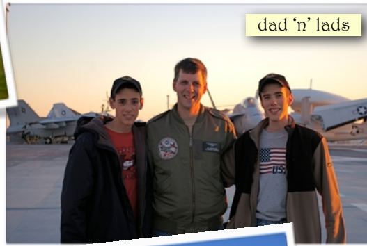
dad 'n' lads