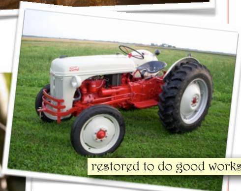
restored to do good works