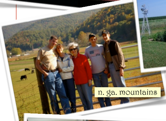
n. ga. mountains