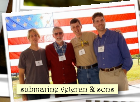
submarine veteran & sons