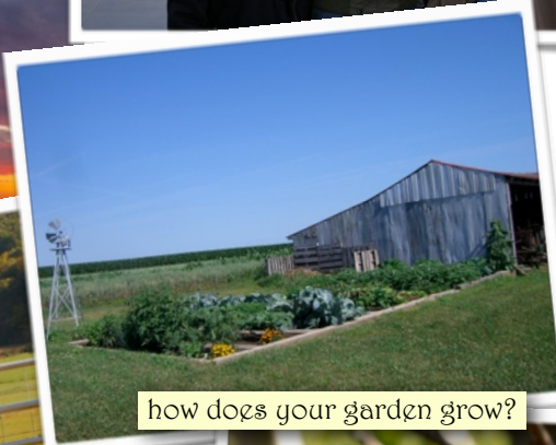
how does your garden grow?