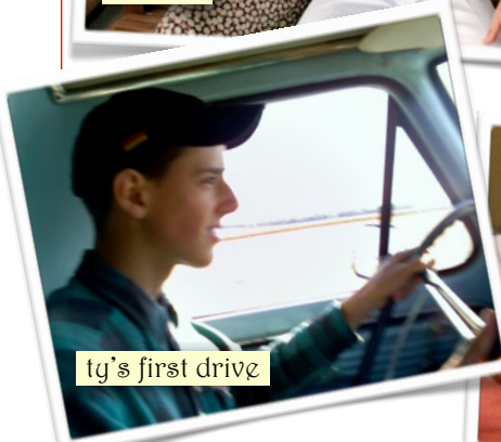
ty's first drive