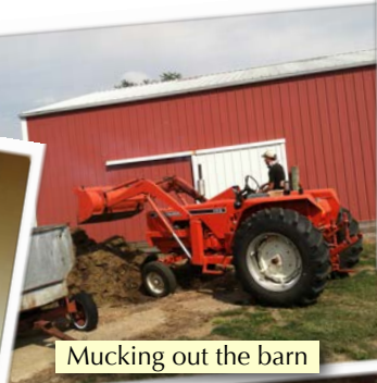
Mucking out the barn