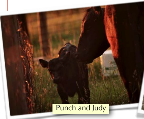
Punch and Judy