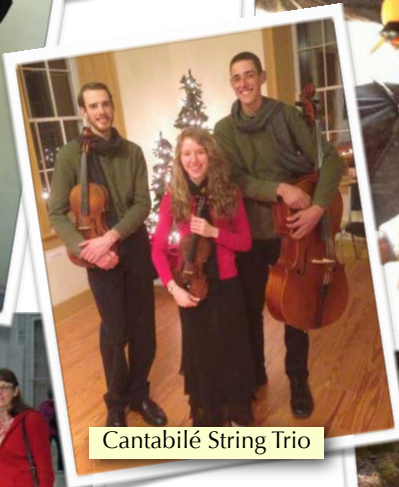
Cantabilé String Trio