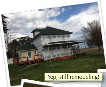
Yep, still remodeling!