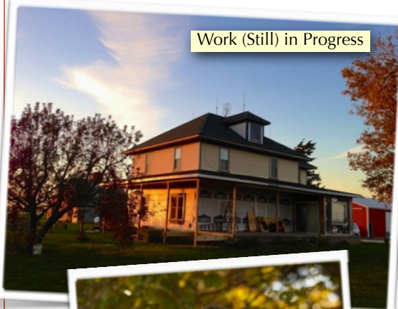
Work (Still) in Progress