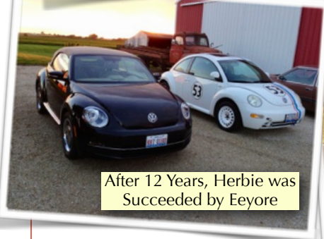
After 12 Years, Herbie was Succeeded by Eyore