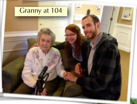
Granny at 104