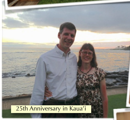
25th Anniversary in Kaua'i