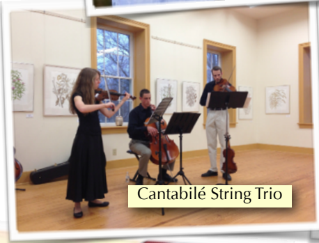
Cantabilé String Trio