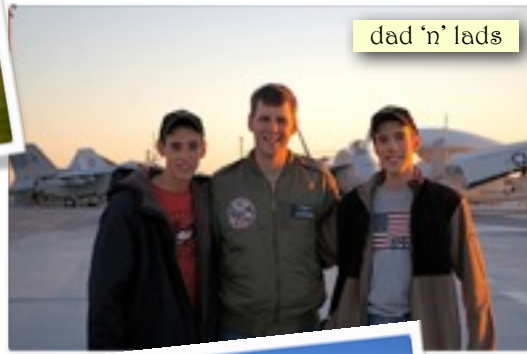
dad 'n' lads