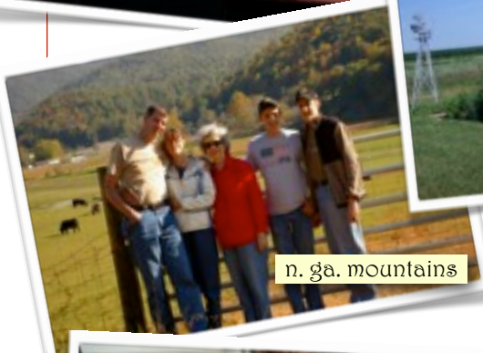
n. ga. mountains