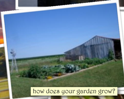
how does your garden grow?