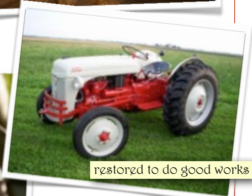
restored to do good works