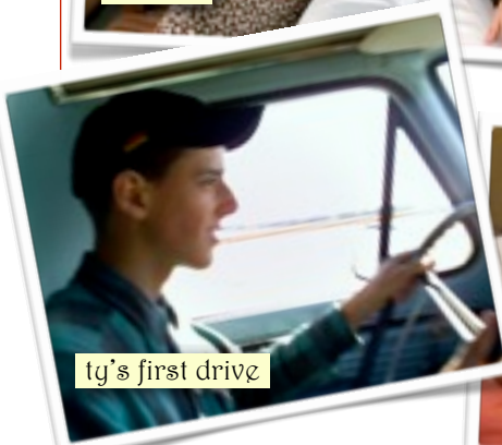
ty's first drive