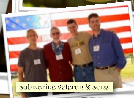
submarine veteran & sons